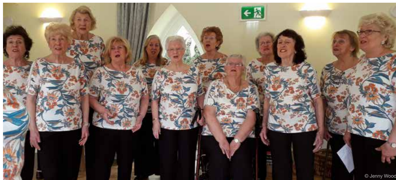
The ladies of the 9 to 5 chorus singing at a residential home in Yatton.

The chorus meets every Tuesday morning throughout the year at the PBA in Shirehampton . However, only a few of the members actually live in Shire. Singers come from as far afield as Nailsea, Churchill, Downend and Chipping Sodbury to sing with the group. And that’s about the same area that the chorus covers in performing for pensioners’ meetings, WIs, and at residential and care homes.