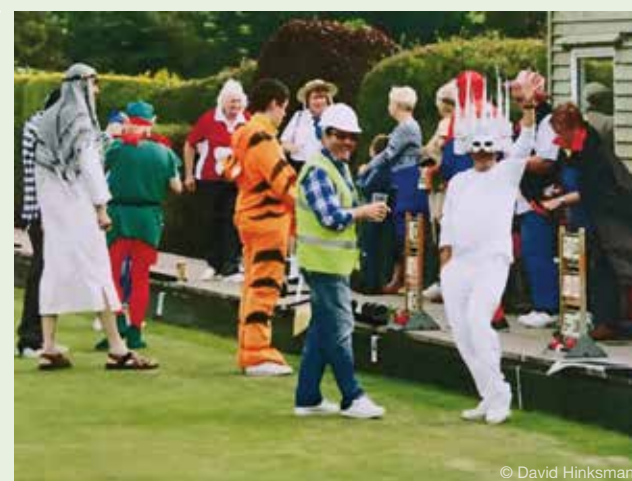
Having fun bowling in fancy dress September 2014.