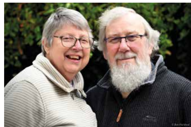
Continues on pages 12-13.