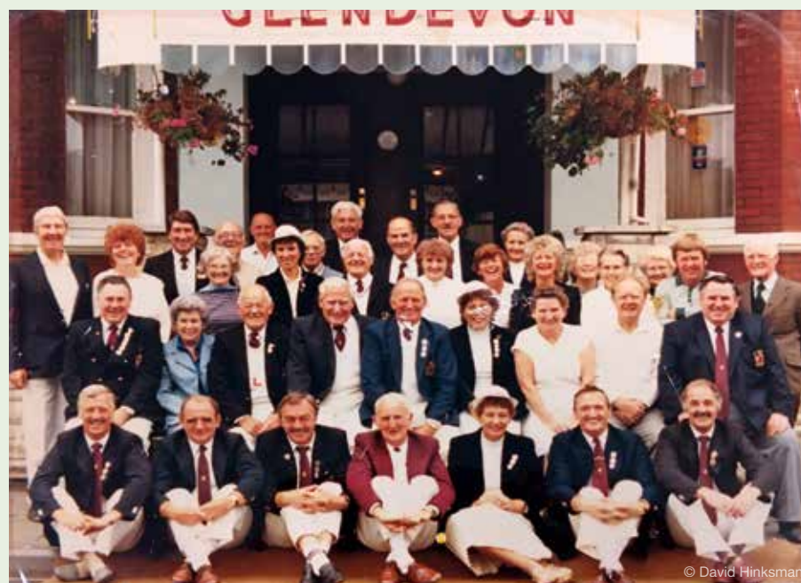
An early & maybe first club summer tour at Bournemouth in 1984.