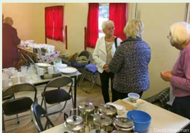
Members only sale day in the pavilion at the club on October 31st 2023.

On October 31st there was a members only sale day which saw catering equipment finding new homes. But the sale of bowling equipment has been a different story, with interest from other bowling clubs in the Bristol area and beyond. Thanks go to the clubs who have bought items. Thanks also to Avonmouth Bowling Club for their kind words in the December edition of Shire.