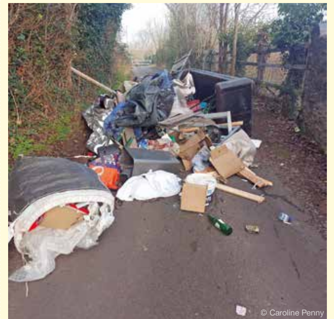
Was seen in Penpole Road at 1pm on 31st Jan driven two men with foreign accents. It was also seen collecting oil from a chip shop in Henleaze Road on the Sunday afternoon before.