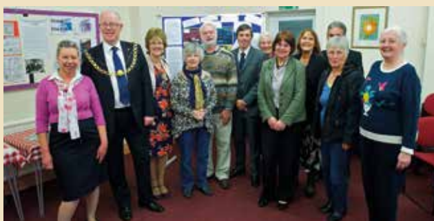
Shire Committee at the 2012 40th Anniversary.