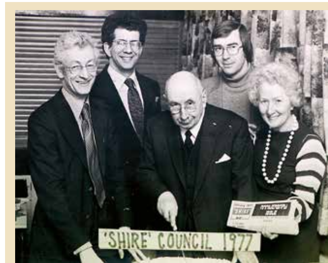
5th Anniversary Shire Council in 1977.