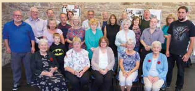
2017 AGM Shire Committee.