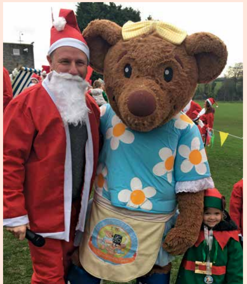
Mama Bear with Mark Millar and an Elf