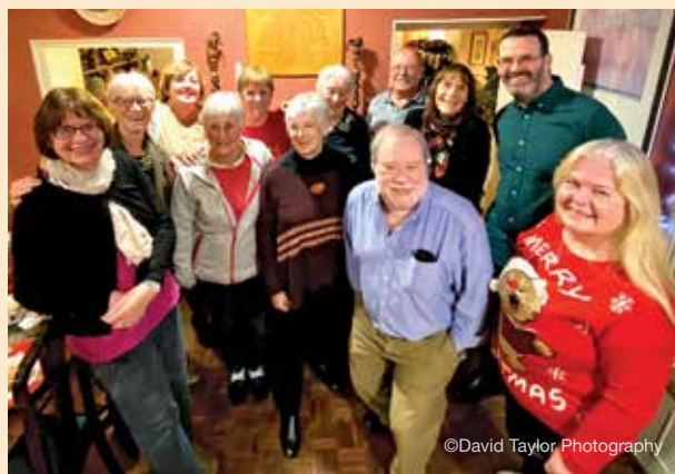
See page 7 for more photos of the Shire volunteers.

To manage the advertising you need to have a computer/laptop and be able to work with advertisers and our designer using email, word processing and spreadsheet software to ensure a good balance between editorial and advertisements. Someone will work along side you in the first instance.