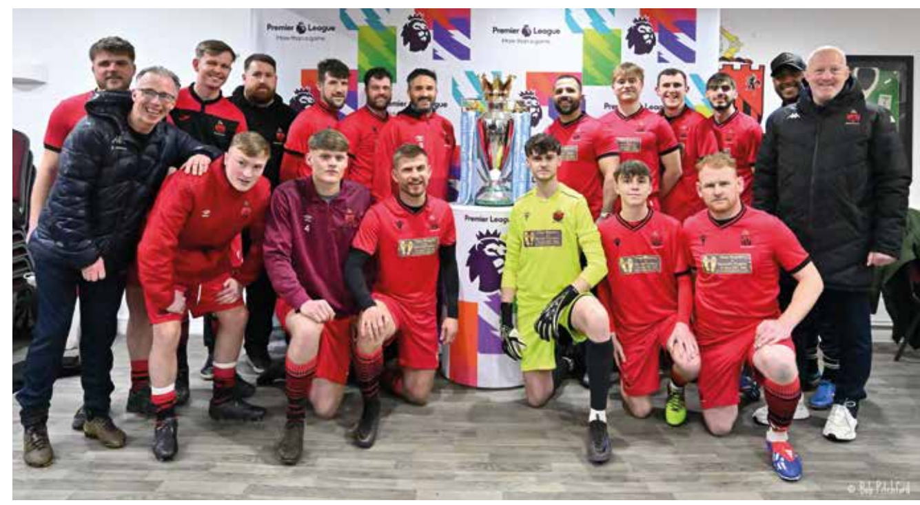
Shire players with the Premier League Trophy.