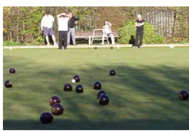
"Roll-upper" Paul drops a "toucher" right on the jack, despite staring into the sun! BRILLIANT!

www.aaronlightbody.co.uk Call or text: 07511 564 605