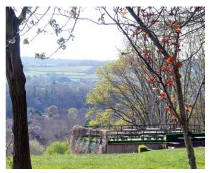
The terrace offers magnificent views over the Avon Valley.

The par 68 course is rented from the National Trust and the club has a ten year development plan; for example, recently extending the eleventh hole, with a new green and bunkers. The course is home to deer and buzzards and at every turn there are exquisite views of the river and distant hills.