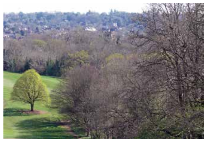
St. Edyth's Church peeks over the treetops.