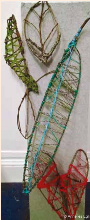
Willow and yarn crafts combined.

Most of us rely on a handful of strategies to help us relax, recuperate and regenerate, often forgetting that there are countless other opportunities we could make use of. Trying out something new, exploring a new environment with new people can bring with it positive experiences and benefits which can surprise us.