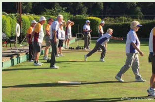
Men's League game against Keynsham B on July 14th. Note the presence of ladies on the green - up to three allowed per game in division four only.

Have you ever looked at something, maybe in the Shire, suggesting that you should come and try bowling and thought, no, not me, I am not interested in bowling. If you have then please, think again. Bowling is one of the leading participation sports in the United Kingdom and a game that anyone can play. You can become a bowler at the City and Port of Bristol Club where free trial sessions and coaching is available and from there you can bowl as much or as little as you like and at what level you choose to bowl.