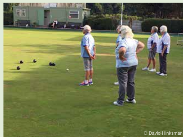
The competitive side of bowling - Ladies League game against Greenbank on July 15th.

Further events will follow through to March and in that month all roads will lead to Torquay for the Annual Winter Bowling Break, one to look forward to, always very much enjoyed.