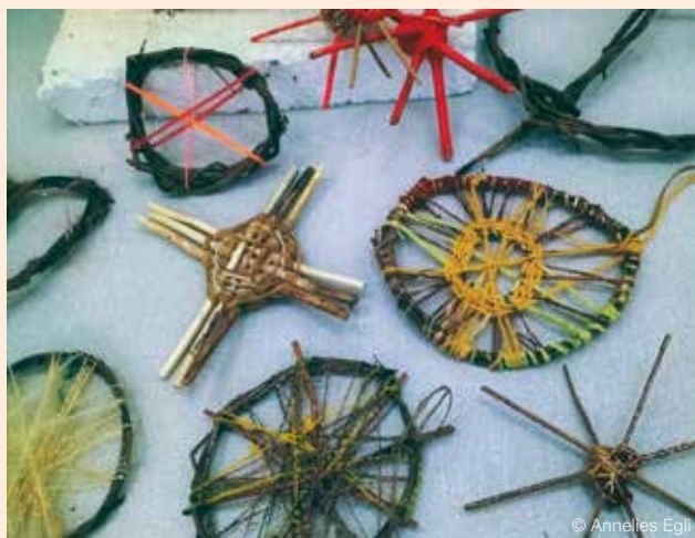
Children's Christmas decorations.